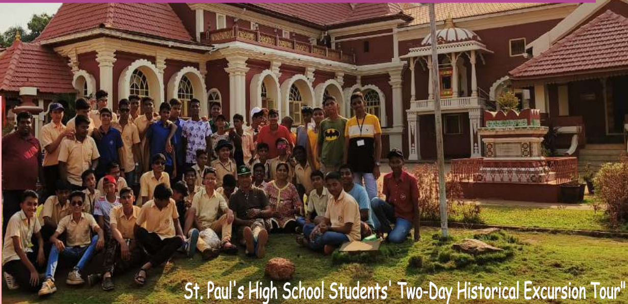
St. Paul's High School Students' Two-Day Historical Excursion Tour"

The Xavier Centre of Historical Research and St. Paul's High School, Belagavi, jointly organized a two-day Historical Excursion tour for 46 Standard 9 students of St. Paul's High School, Belagavi. The students were given an enriching exposure to Goa's rich history through visits to various churches, temples, historic ruins, and museums.