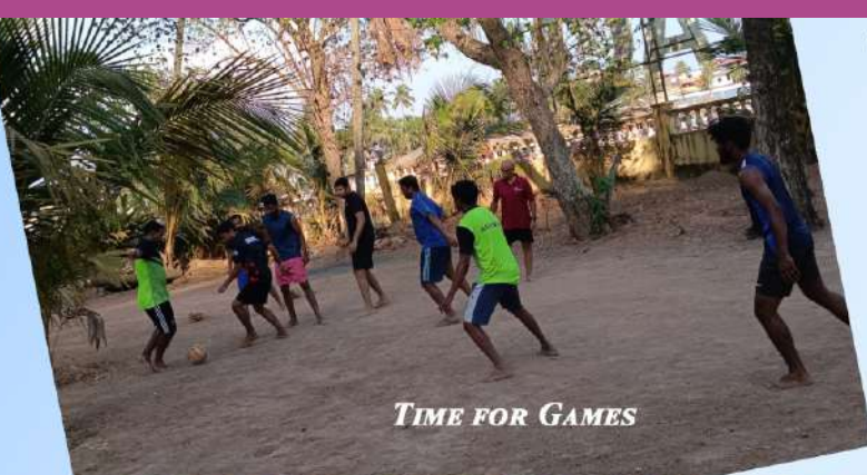
TIME FOR GAMES