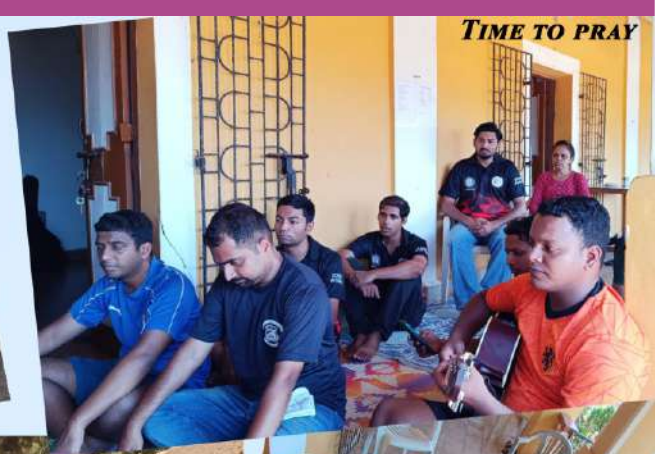
TIME TO PRAY