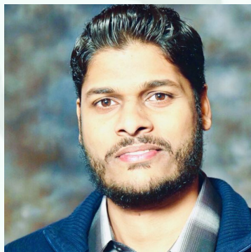
Jovilton Afonso Pedro Arrupe Institute Raia