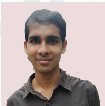
Neville Gonsalves Xavier Training College, Belgaum