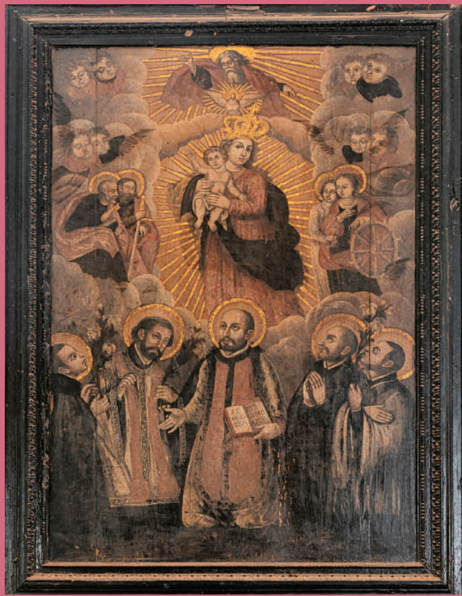
Front cover: Menino Jesus. Infant Jesus, Saviour of the World.

Step into a captivating journey through time and culture with “The Jesuits, Goa and the Arts.” Embark on an exploration of the dynamic interplay between faith, imagination, and creativity that unfolded in the heart of Goa from the mid-sixteenth to the eighteenth century. This masterfully crafted volume unveils an extraordinary narrative of collaboration and convergence, where European Jesuits and the vibrant Goan populace converged to shape a distinctive artistic legacy – the Modo Goano .