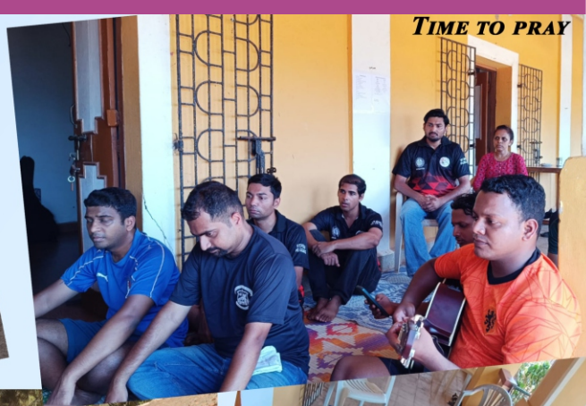
TIME TO PRAY