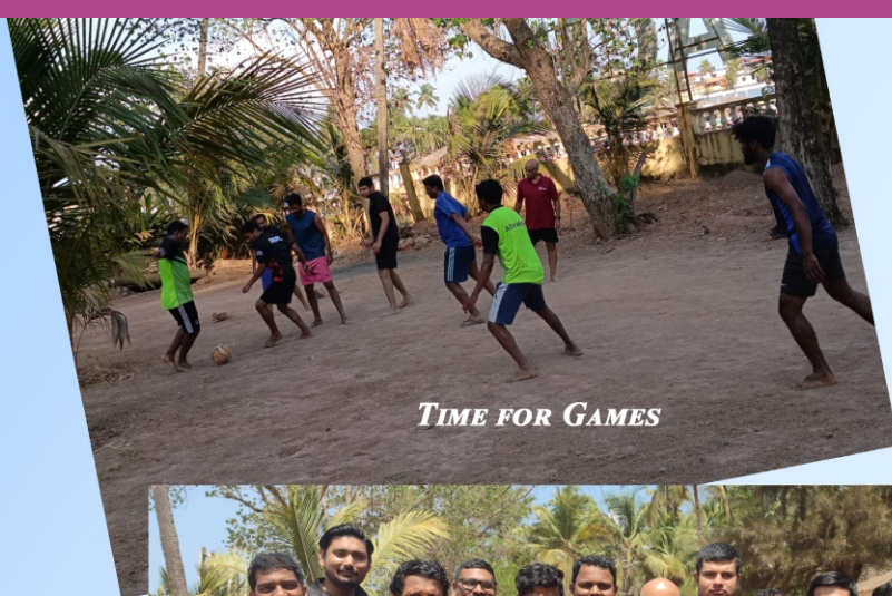
TIME FOR GAMES