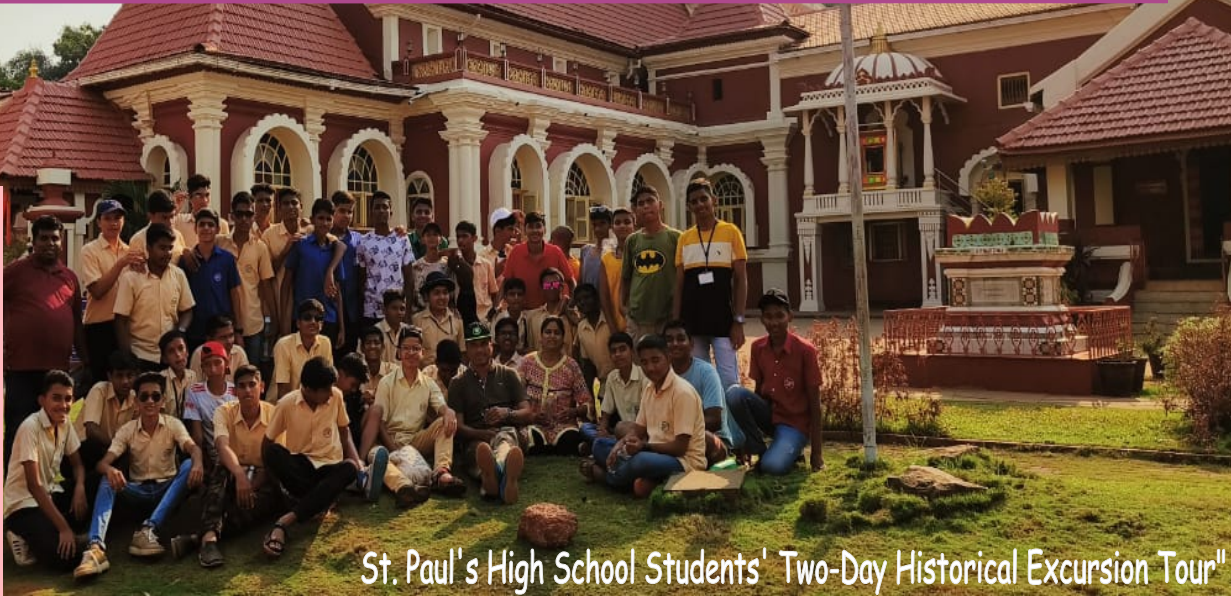
St. Paul's High School Students' Two-Day Historical Excursion Tour"

The Xavier Centre of Historical Research and St. Paul's High School, Belagavi, jointly organized a two-day Historical Excursion tour for 46 Standard 9 students of St. Paul's High School, Belagavi. The students were given an enriching exposure to Goa's rich history through visits to various churches, temples, historic ruins, and museums.